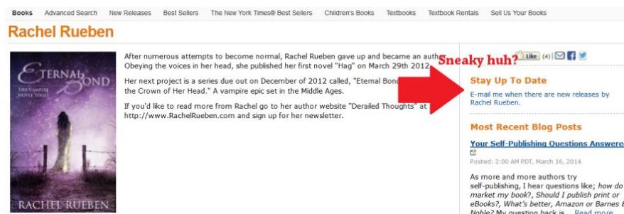
My Amazon author page (Above)

Email lists are quickly becoming more important than social media to a lot of authors. It's gotten so important that even Amazon is collecting email addresses on your Amazon author page!